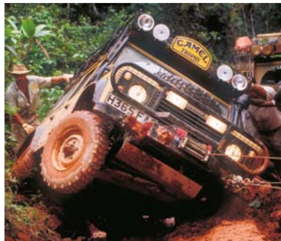
The Camel Trophy days – when the going got tough, the Defenders still pulled through.

But beyond urban areas and off all tarmac classified with an 'N', the Defender is in its element. Bumpy dirt roads are just ironed out and a cruising speed of 120km/h is more than acceptable. Get to more difficult stuff and the Defender shines. You